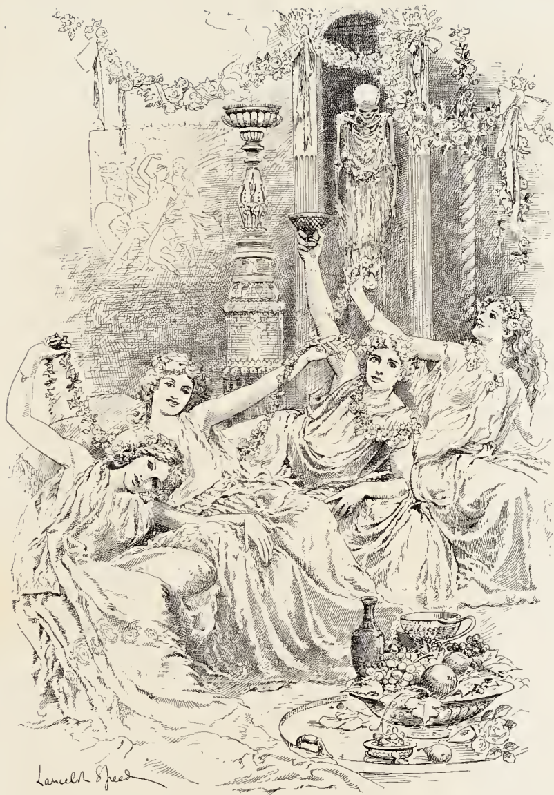
"The banquet of Arbaces."